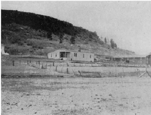
A Capulin Ranch Capulin, Union County, New Mexico c. 1916