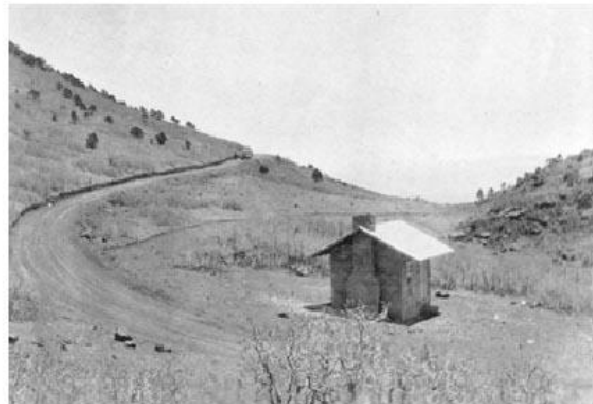
Road to Capulin Valcano Capulin, Union County, New Mexico c. 1916